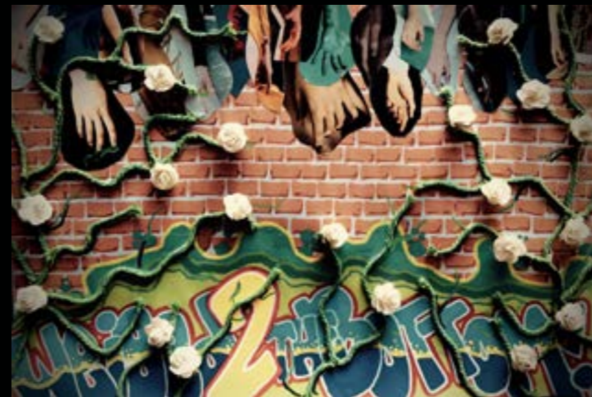
"Weighed to The Bottom" collage