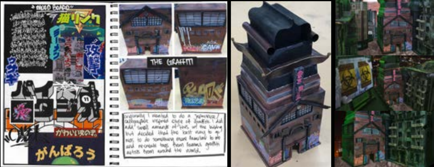
Dystopian building concept - green screen stills attached