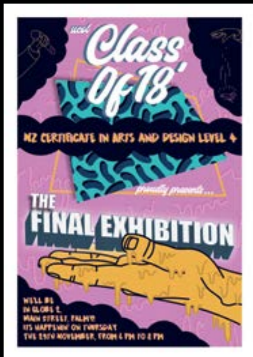
Exhibition Poster Concept