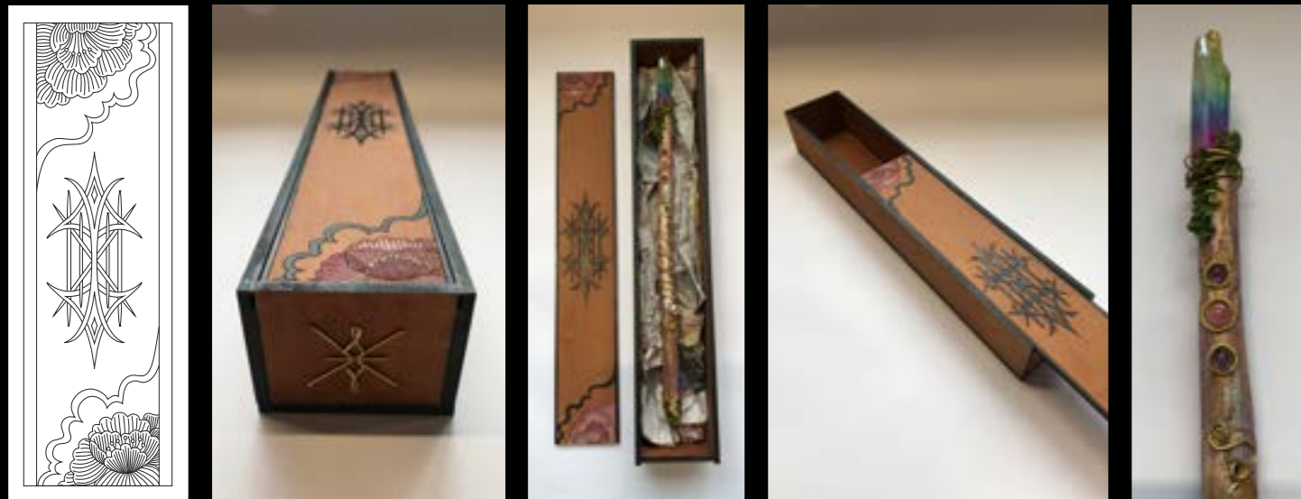
World building artefact (Crystal wand in laser cut sliding box)