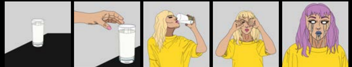
"Conspiracy" digital drawings for end of year exhibition