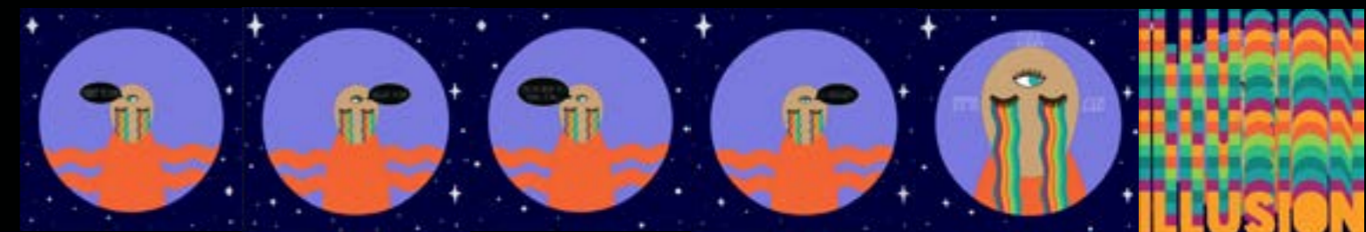
"It's all an illusion" loop text/shape animation