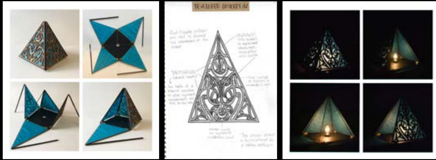
Ngake & Whataitai inspired sculpture concept model (interactive)