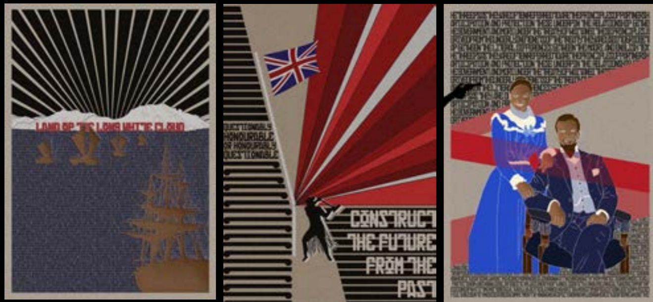
"Coloniser" posters ironically inspired by war propaganda