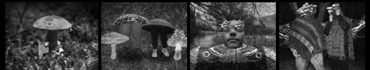
"Goblin Boyz" mixed media print + photography