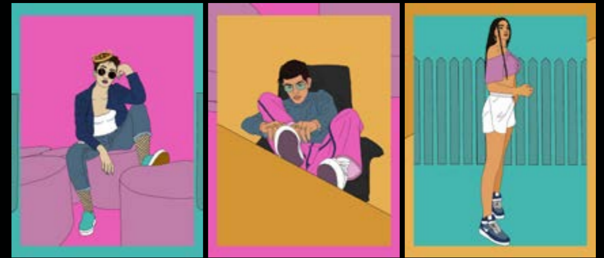
"Flava" digital drawings for end of year exhibition