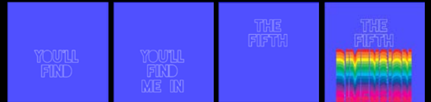
"You'll find me in the fifth dimension" loop text animation