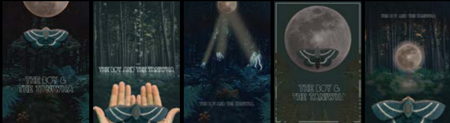
"The Boy & The Taniwha" childrens book cover re-invented