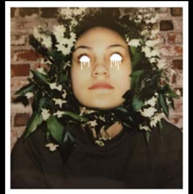
"Beauty in Graf" mixed media polaroids